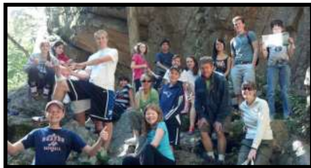
Youth Group Hike (2012)

Outreach and mission are particularly important in the life of our church. We serve through advocacy, action, and financial support. Local missions we support include: