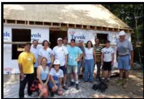
SMUMC’s first Habitat for Humanity build