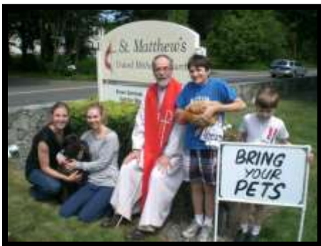
Pet Blessings (2012)