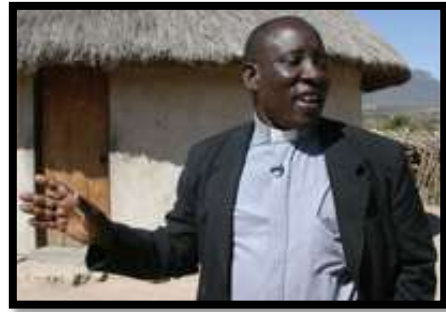
Central Conference Pastor

Globally, PAS will tithe 10% of all funds raised for Because They Serve to the Central Conference Pension Initiative . 5 This initiative provides seed money for a fund that offers pensions for pastors serving in parts of Africa, Asia, and Eastern Europe , where there is currently no pension program due to the financial situations in these areas. In short, the money we raise will benefit people in Acton, retired pastors throughout New England, and people across the world in Africa, Asia, and Eastern Europe. Funds raised during Jubilee will be allocated as depicted in the chart below.