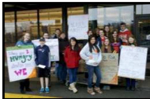
Youth fight local hunger (2012)