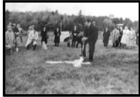
Breaking Ground for St. Matthew's (1964)